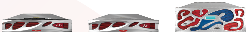
DDN storage appliances are fully-integrated and optimized for AI and DL workloads.

To meet the requirements of a variety of workloads, DDN A 3 I with NVIDIA DGX A100 leverages the DDN AI200X, AI400X and AI7990X storage appliances. The AI200X and AI400X are all-NVMe, fully-integrated parallel file storage appliances that deliver up to 48GB/s of throughput and over 3M IOPS to applications, accelerating even the most I/O intensive workloads. The AI200X and AI400X are specifically optimized to keep GPU computing resources fully utilized, ensuring maximum efficiency while easily managing tough data operations. The AI7990X is a hybrid, parallel file storage appliance that integrates both flash and deeply expandable capacity disk in a unified system for simplicity and flexibility. This integration makes it easy to collocate both hot training data and large libraries while maintaining optimal system efficiency. The AI7990X outperforms competing platforms and delivers the economics of capacity disk for your growing data library.